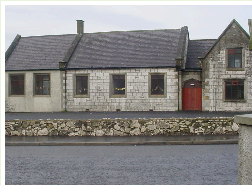
The Old School

The school crest, on the cover of this prospectus, has elements of special significance and relevance to Money more. The symbol of the shamrock and the central cross relate to St Patrick, that of the oak leaf and acorn reminds us of Derry, while the shrubbery is associated with the Irish word 'Muine' from which Money more got its name. The Bible reveals St Trea holding the book in her hand and the Cross of St John honours the other patron Saint of the Parish.